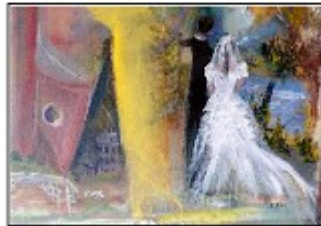
NORMA J RAWLINGS

PAINTING PHOTOGRAPHS AND 3D WORK ON THE THEME OF LOVE UPTON COUNTRY PARK BH17 7BJ OPEN DAILY 10-4 FROM 13TH FEBRUARY-24TH FEBRUARY